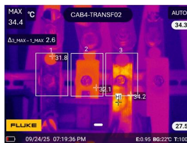
Automatic 3-phase maximum temperature difference calculation with one-click

With built-in route inspection function, pre-set inspection routes help track inspection progress in real-time to avoid missed inspections. This offers a new digitized option for scenarios where QR codes do not work.